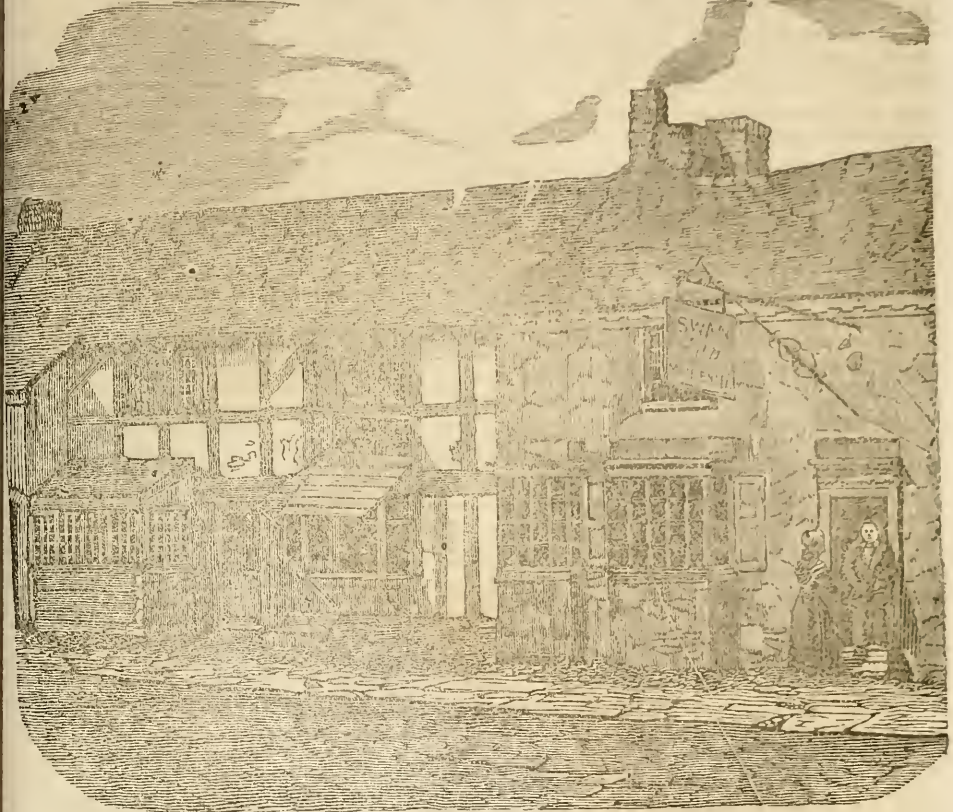
BIRTH PLACE OF WILLIAM SHAKESPEARE.

in the profoundest gloom, except where occasional flashes of intrepid genius, unawed by the frowns of fashion, or the laugh of big-