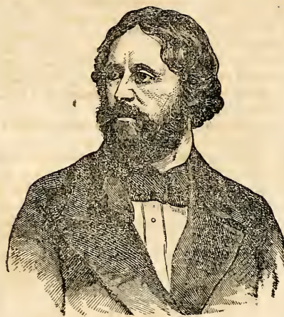
THE NATIVITY OF

☞ I may refer to this Nativity again in a future No.