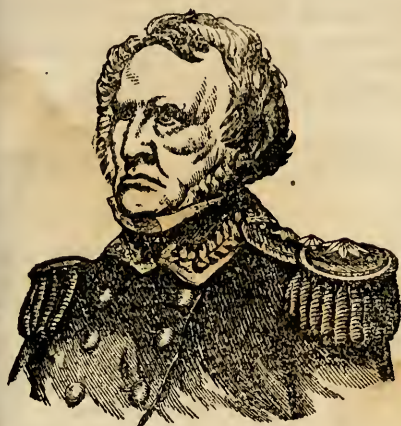
THE NATIVITY OF