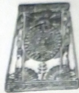
The Mayan Emblem

O UT OF the dim distant ages comes a voice bearing the secret of the mystery of mysteries—Revelation. Through thousands of years students and sages have sought the secret without success. Yet the secret is now laid bare in the most remarkable book in the last decade—the book that thousands have bought and then re-ordered to give to friends. That book is called “The Revelation Secret.” Have you read it?