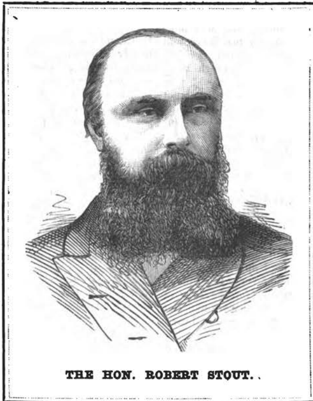
THE HON. ROBERT STOUT.

We now regret that we lost sight of an article giving a personal sketch of Mr. Stout: his early career; his upward course in his profession; his appearance and habits, and enormous capacity for work. It did not occur to us that we would have the pleasure of printing his portrait, with the necessary remarks accompanying, or we should have carefully preserved that fragment. Deeply we feel the want of the facts which it contained.