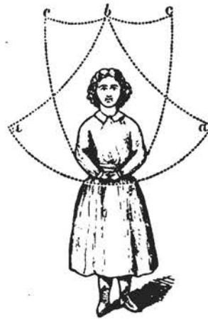
FIG. 1.—POSITION FOR WING MOVEMENTS.

6th Command.—Position erect, with the right hand resting in the left, as seen in Fig. 1 at d .