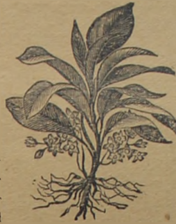
The Kola Plant.