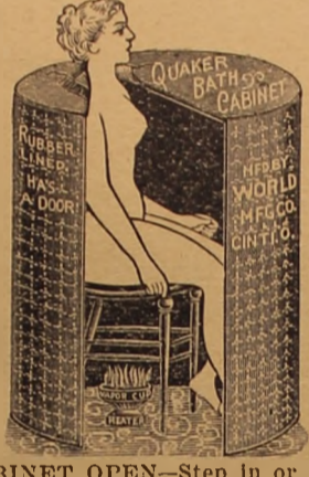
CABINET OPEN—Step In or Out.

It is a sealed compartment, in which one comfortably rests on a chair and with only the head outside, may have all the invigorating, cleansing and purifying effects of