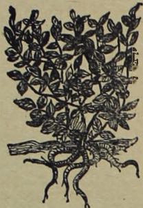
THE KAVA-KAVA SHRUB (Piper Methysticum.)

A short time ago our readers were made aware of a valuable new botanical discovery, that of the Kava-Kava Shrub, or as botanists call it, piper methysticum, found on the banks of the Ganges river in East India. From a medical standpoint this is perhaps the most important discovery of the century. The use of the Kava-Kava Shrub, like other valuable medical substances, opium and quinine, was first observed by Christian missionaries among the natives as a sovereign remedy for Kidney diseases and other maladies caused by Uric acid in the system. Since its general introduction, Alkavis, (the Kava-Kava Compound) has wrought many remarkable cures of Kidney and Bladder and Rheumatic diseases.