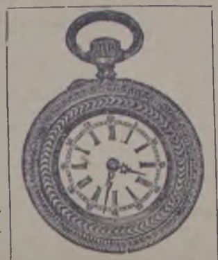
COIN SILVER CASE. Silver cap, assorted engravings, jeweled, gilt movement

THE LIGHT OF TRUTH will send to the getter up of a club of Ten Yearly Subscribers accompanied by the cash, ten dollars, a beautiful STERLING SILVER WATCH , like cut. This Company has arranged with a big jewelry establishment for a limited supply of these watches to be given away practically. They are in every way substantial and popular time pieces, and thousands of them are in use. Here is something for the young women to do. Certainly it can not be difficult to obtain ten subscribers in your town or city, and for each club of ten you get one of these watches.