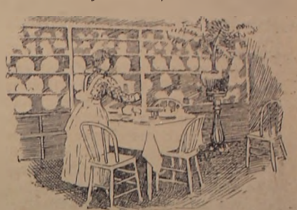
A CORNER OF THE WOMEN'S DINING ROOM

Now if I am right in assuming that the purpose of tree science is the advancement of the good of humanity, (I say true science because there are so-called sciences,) then it follows necessarily that the true science of political economy will be the lighest of all the practical sciences, because it will deal directly with the best human arrangements and the best practicable code of public and individual conduct. Having the best good of the race directly in view, so far as terres-