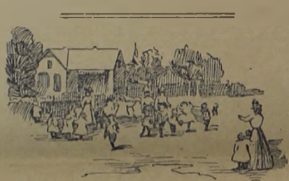
KINDERGARTEN CHILDREN ON THE LAWN.

Every institution requiring the labor of men and women, whether factory, store, railrond, government institution, church, school or home, will find here that which can be done with benefit. It is not claimed that every institution could adopt all these methods at once, but there is not one that could not immediately use some of them to great advantage.