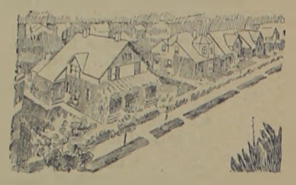
VIEW OF THE HOUSES.

There is a miniature yet exceedingly practical industrial republic at Dayton, Ohio. Here are some of its points. For the 1,626 employes the company provides management by committees instead of by a superintendent. A