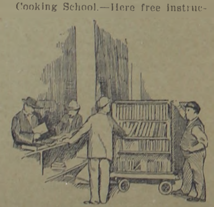
A FACTORY LIBRARY ON WHEELS.

The 205 women have organized the only federated women's club composed exclusively of working women. Entertaining and instructive programs are arranged by as members.