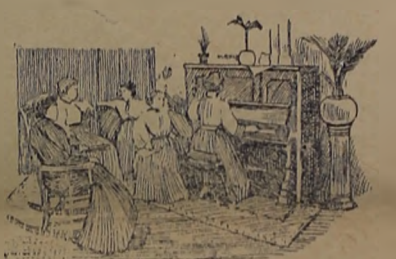
RUCREATION AT NOON IN THE DINING ROOM.

What, then, is the essentially human principle, the great moving factor of human progress as distinguished from the brute principle just noted? I find it under different names in the various fields and modes of its operation, but as an elementary principle I can find no other name for it than harmony. Harmony, which, in the interectual realm is reason, sound philosophy and wisdom. Harmony which expresses itself in peaceful co-operation, orderly social life, in justice, equity and the