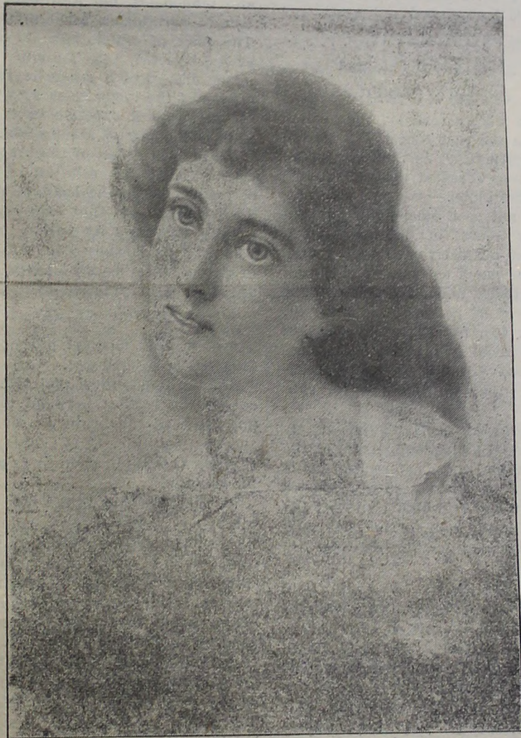
SPIRIT ART.—(See Page 6.)