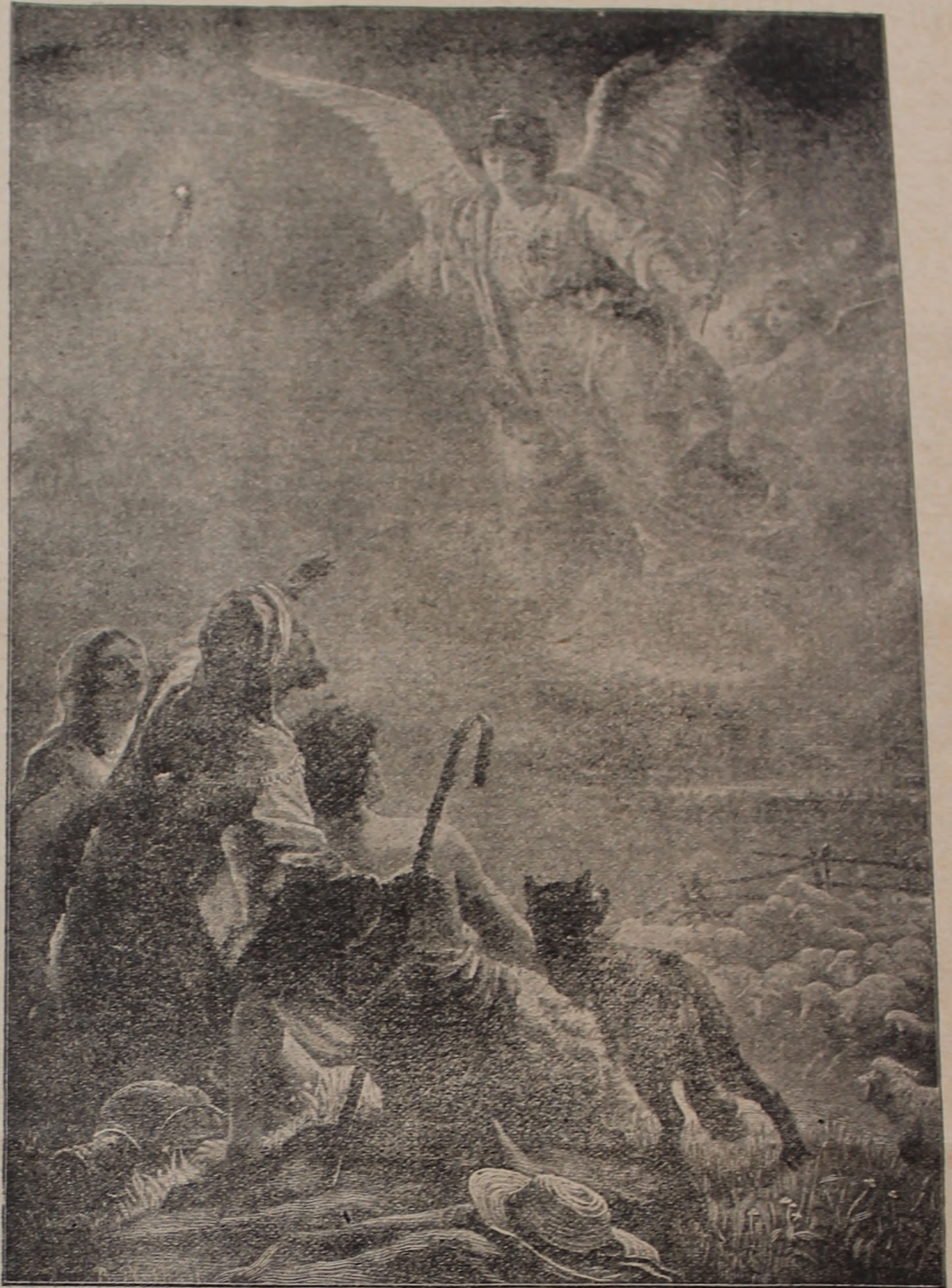
THE STAR OF BETHLEHEM.