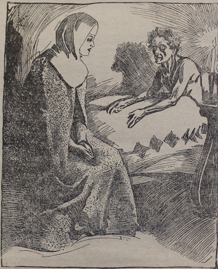
DYING MAN SEES HIS SPIRIT WIFE.