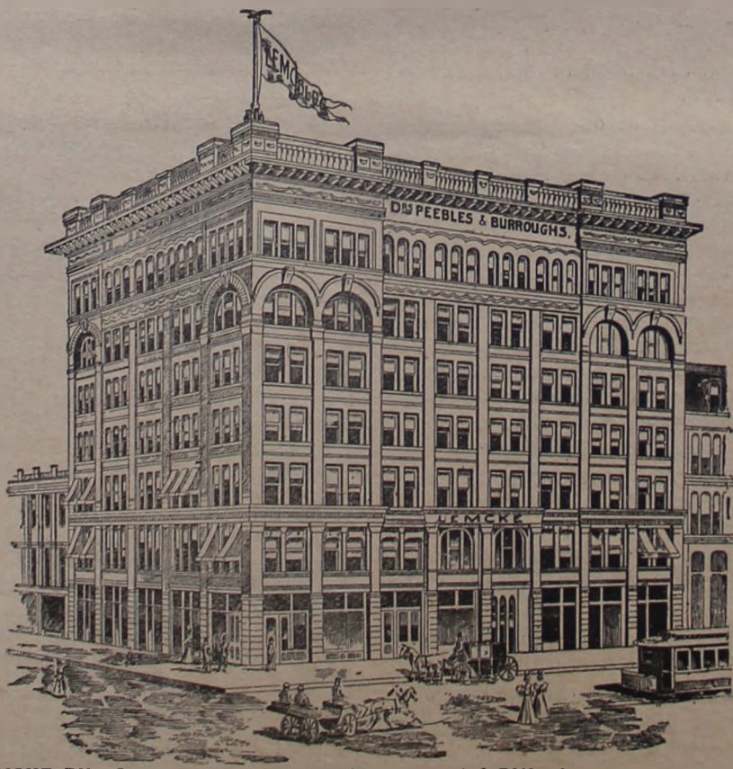
LEMCKE BUILDING—OFFICES OF DRS. PEEBLES & BURROUGHS, 725, 726, 727, 728.