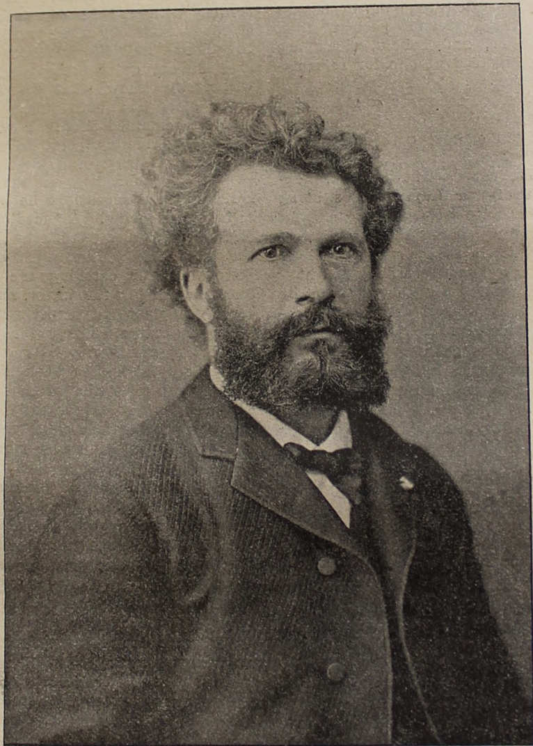
C. FLAMMARION, Astronomer.