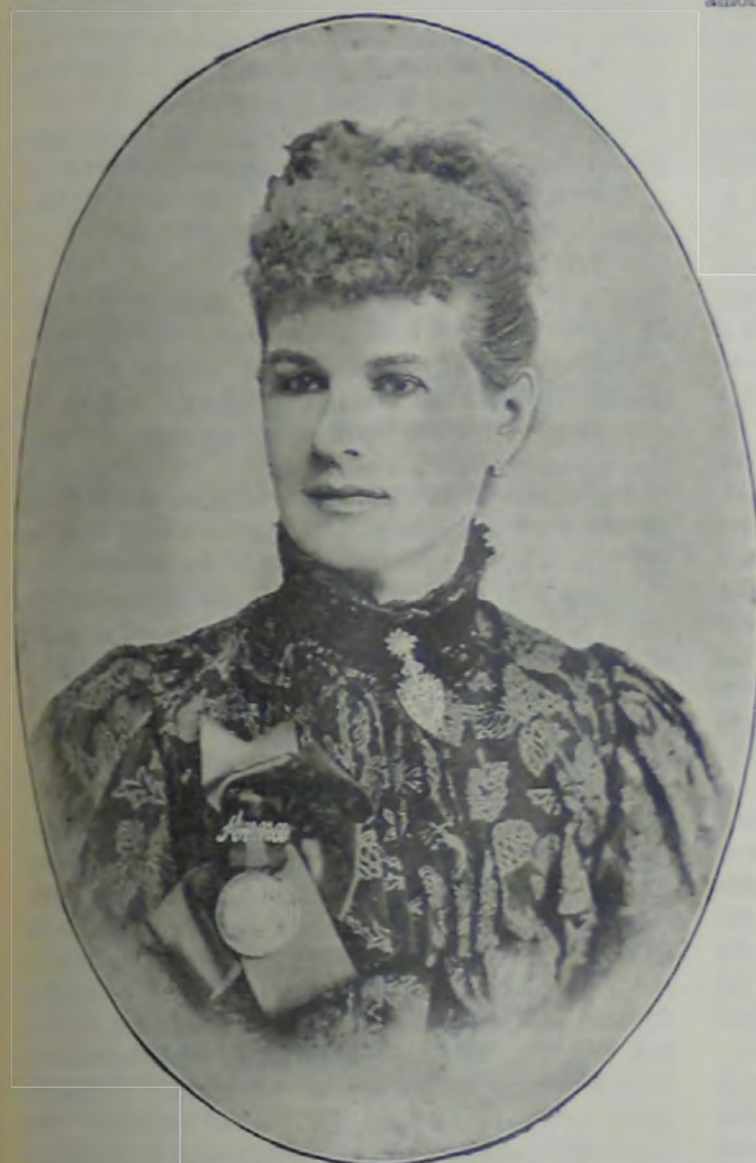
THE LATE DR. ANNA KINGSFORD.

Mr. Maitland's little book called 'The Story of the New Gospel of Interpretation,' told us much within a small compass, but we now have a full-length portraiture; we are shown Anna