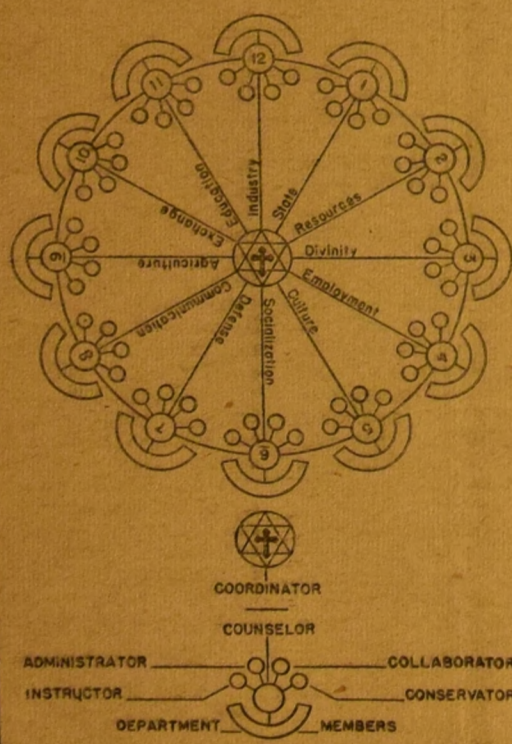
Diagrammatic Representation of the Departmental Organization of the Temple of the Jewelled Cross depicted in the form of a clock. Since State is the Number One Department in the New Order, the clock of the New Age will commence its first hour at the meridian.