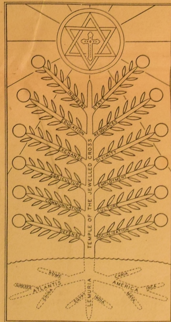
The Temple of the Jewelled Cross derives its history and traditions from three great races — the Lemurian, the Atlantean, and the American. The above diagram describes the Tree of Life as it is being replanted in a New Earth, the branches being the vocational divisions of the New Order and the fruit the virtues achieved by those New Age Citizens who master the work for which they incarnated. Note the various nations from which the Mukulian Israelites have migrated over the ages.