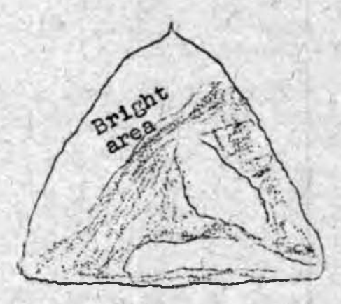
Copied from the News Photo

"The Spanish Air Force, which picked up the unidentified object on their sophisticated American-designed radar network, dispatched F-104 jets to investigate. One pilot attempted to approach the object at an altitude of 50,000 feet but was forced to give up the chase with the device still a great distance above him, when his fuel ran low. Another pilot came close enough to give a graphic description of the device, 'It was pyramid shaped and there were three globes of bright light at its base.'