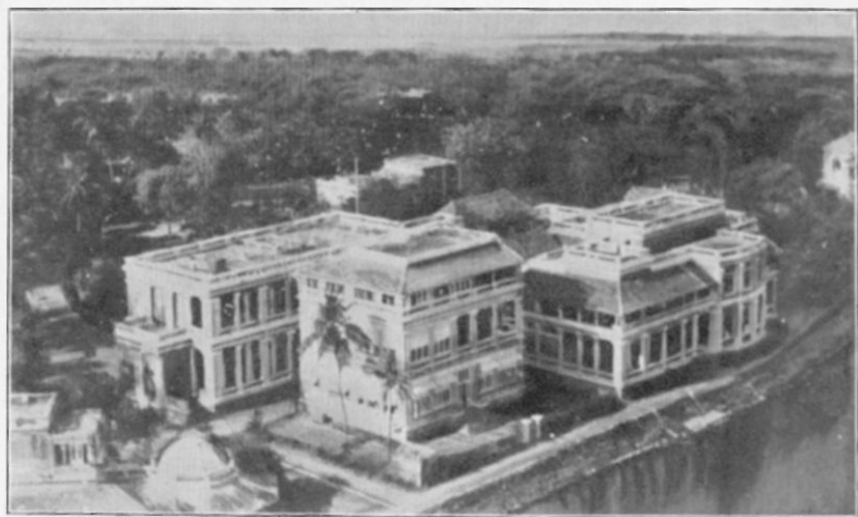
HEADQUARTERS AND ADYAR LIBRARY