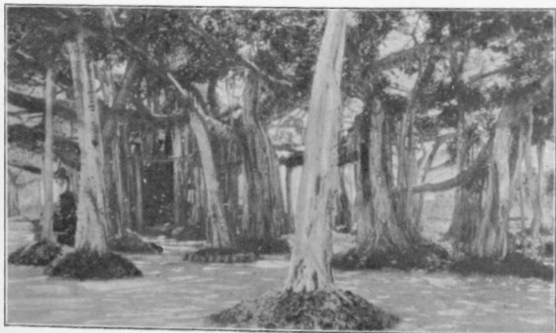
THE FAMOUS BANYAN TREE: SCENE OF MANY GREAT GATHERINGS AND GREAT ORATIONS