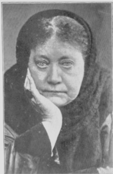
H. P. BLAVATSKY