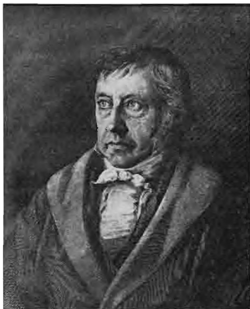
GEORG WILHELM FRIEDRICH HEGEL

ical teachings of the Greeks with the psychological findings of Emanuel Kant. The broad foundations which he laid down have influenced many subsequent scholars and have contributed to the revival of classical learning in the contemporary world. Hegel distinguished clearly between what he considered natural and manmade theologies. He felt that the doctrines and dogmas derived from the Bible, both the Old and New Testaments, if literally accepted by the mind and consciousness, placed upon man an unnatural burden of imposed morality instead of awaking from within him those intuitive ethical and spiritual virtues which, if disciplined and matured, should provide him with a proper philosophy for living. He would not accept such religious limitations as would tend to separate human living from the life of Nature. In other words, the world, its codes, creeds, and doctrines, must never be permitted to develop patterns which were opposed to the true, natural, and proper experience of the human spirit.