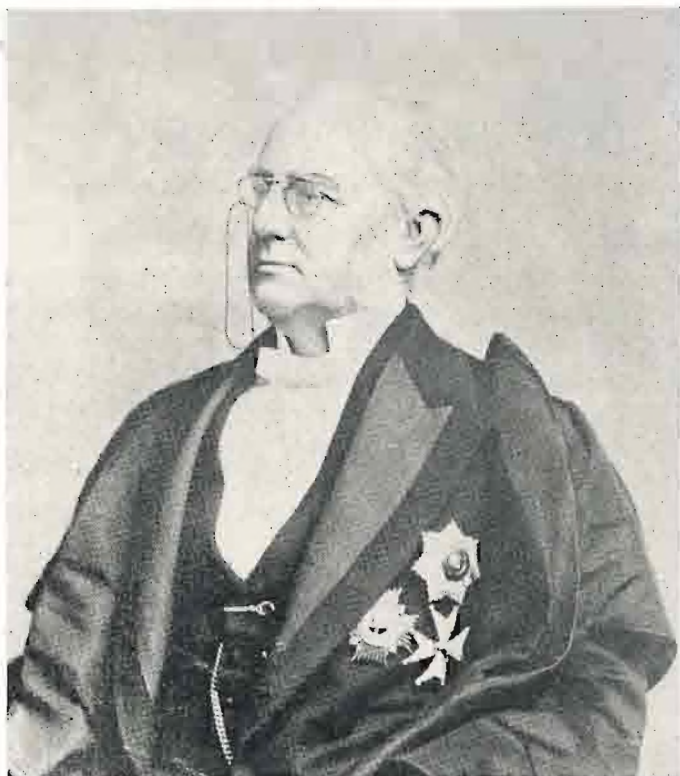
FRIEDRICH MAXIMILIAN MUELLER

Photograph taken on the occasion of his 50th anniversary as Doctor in the University of Leipzig.