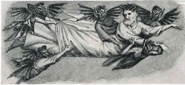
SIMON MAGUS SUPPORTED IN THE AIR BY DEMONS