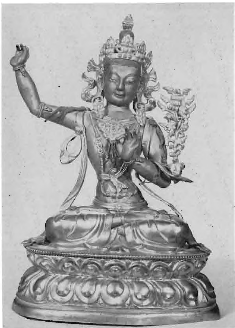
PLATE I THE BODHISATTVA MANJUSHRI

dress, the positions of the hands, implements carried or incorporated into the decorations, and ornaments which are essential parts of each work. A convenient way to include these attributes is the use of a floral device, the summit of which sustains some specific article.