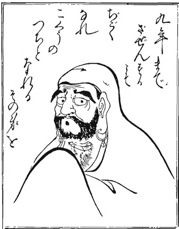
BODHIDHARMA, 28TH PATRIARCH OF ZEN