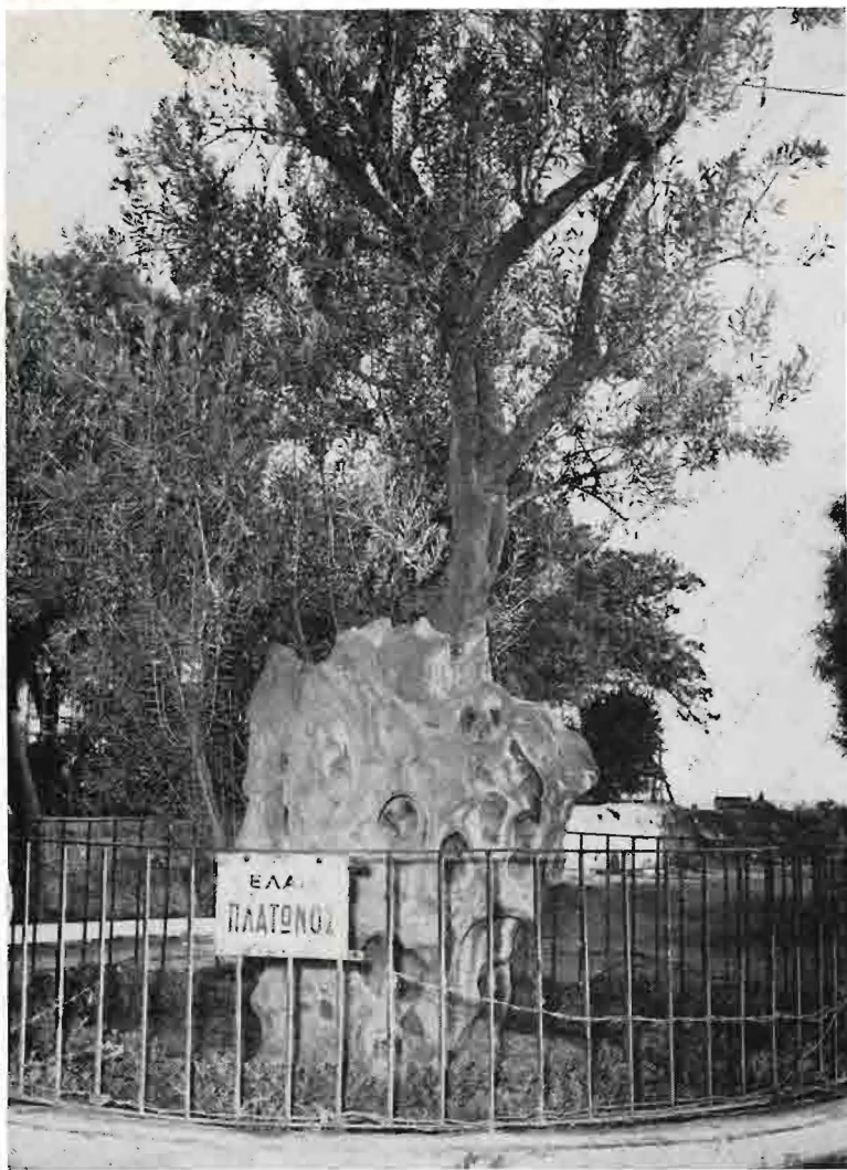
PLATO'S OLIVE TREE

Through the kindness of a friend who attended the recent Pythagorean festival in Greece, we are able to reproduce herewith a photograph of the Olive Tree under which Plato taught his disciples more than 23 centuries ago in Athens. It is interesting and significant that from the ancient trunk a live tree is growing, which may well symbolize that the teachings of this great philosopher live in the modern world as a constant source of enlightenment and inspiration.