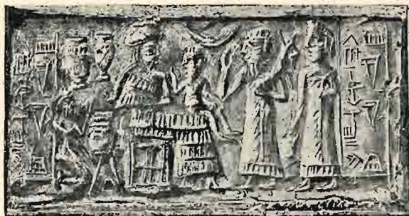
THE GODDESS ISHTAR SEATED, RECEIVING THE OFFERINGS OF HER PRIESTS AND SURROUNDED BY SYMBOLS