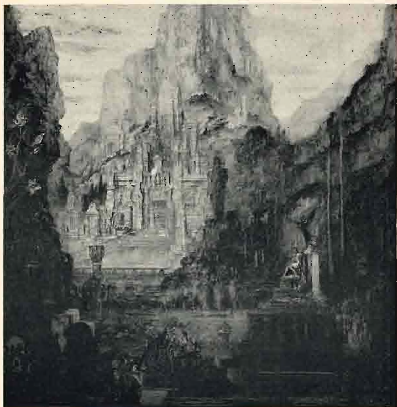
—From the Works of Gustave Moreau