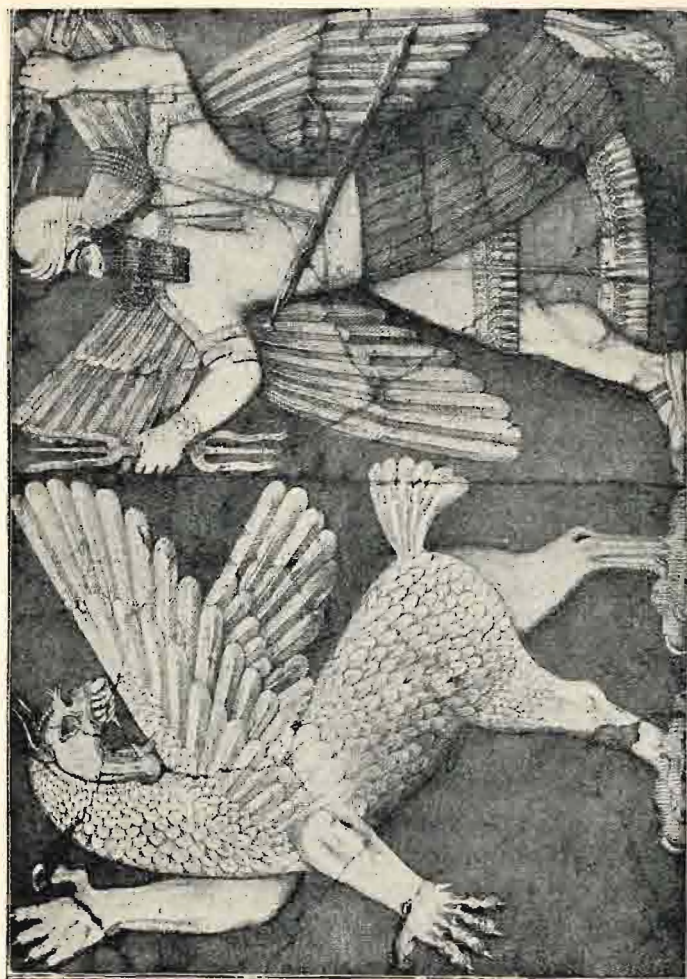
THE BATTLE BETWEEN MERODACH AND TIAMAT From two limestone slabs in the British Museum, reproduced by L. W. King.