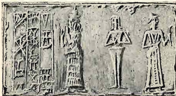
ISHTAR, THE CENTRAL FIGURE IN THE ABOVE GROUP, REPRESENTED IN HADES DEPRIVED OF HER GARMENTS AND ADORNMENTS

From intaglios reproduced in Maspero's History of Egypt, etc.