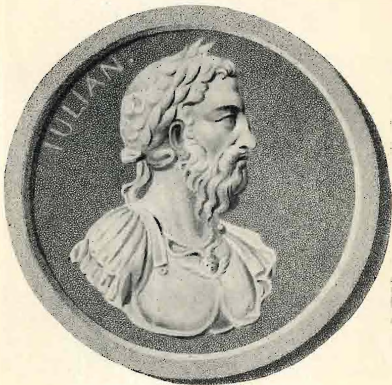
FLAVIUS CLAUDIUS JULIANUS