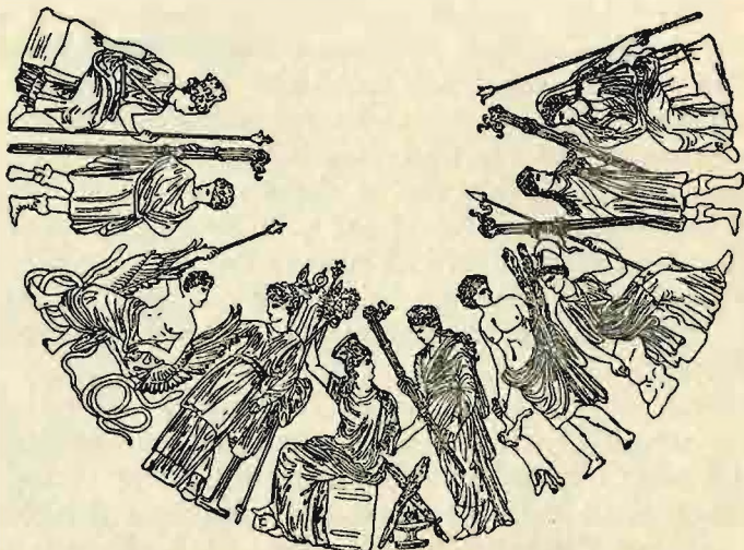
THE DIETIES OF THE ELEUSINIAN MYSTERIES

held the writings of Plato in similar veneration. He was accompanied on his campaign by philosophers and scholars, and on his deathbed conversed with Maximus concerning the immortality of the soul in a manner reminiscent of the last discourse of Socrates. As an initiate of the ancient Mysteries, Julian could scarcely have rejected the transcendental implications of these rites. He obviously accepted them and practiced their disciplines insofar as he was able.