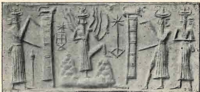
SHAMASH, THE GOD OF THE SUN, RISING THROUGH THE EASTERN DOOR OF THE HEAVENS