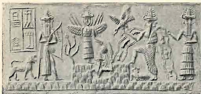
THE GODDESS ISHTAR REPRESENTED AS WINGED AND STANDING BESIDE A SACRED TREE