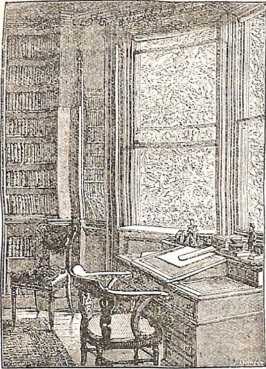
Charles Dickens' Study at Gadshill.

writers who make their mark. In this as in other work, we are not sent into this world to be automatons. Those who achieve fame in any department of life are not those who wait for so-called "guides" to do their work for them, but who with mind and soul in tune with the infinite, are open to the waves of inspiration that come from the spheres, which they use with all the skill that training and industry can alone give.