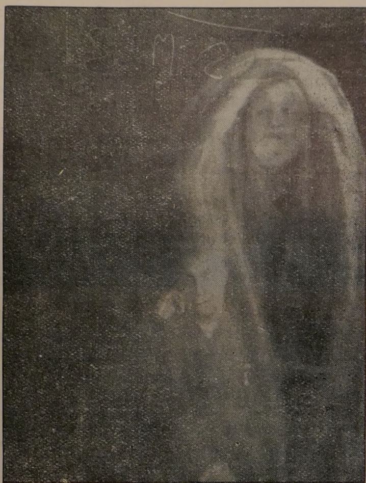
Mrs. W. T. STEAD, WITH PSYCHIC "EXTRA" OF HER HUSBAND.

suppose that out of the millions of those cut off by death there should be any individual recognition intended? The demonstration is one of world-wide import, a message to the race at large, and the faces typical of British youth; symbols only of a larger hope to those that remain in the valley of tribulation and perplexity. Identification in such a case is bound to be difficult, and even if claimed, could always be disputed, for none of the faces is large enough nor sufficiently sharp in outline to establish the assurance of personal identity. All are types that may be paralle-