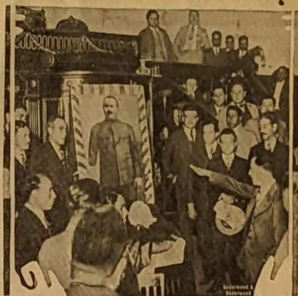
Though General Obregon is dead, his followers in Mexico are still loyal to him. Above is seen a group of the Obregonist members of congress swearing before his photograph and death mask to do all in their power to carry out his ideals.