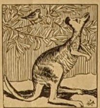
"That is Probably So," Agreed the Sparrow.

"Now the Brush-Tailed Wallaby is cousin. He is the Agile Wallaby, because he can move easily and quickly."