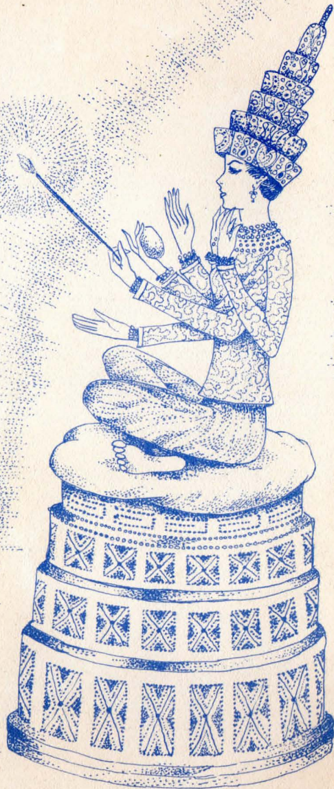
Love's Many Hands