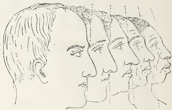
Grades of Intelligence.

An ordinary pair of shoes costs $3. for that price you can get a typewritten Character delineation and health test that will indicate the occupation for which you are best fitted mentally and temperamentally: it points out the powers that should be cultivated or restrained, and contains much other valuable advice. Full typewritten delineation with health chart $5. Special rates to families and clubs of 5 or more.