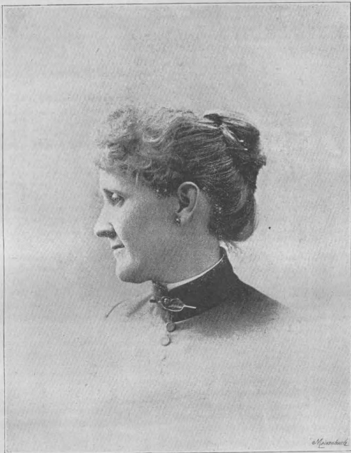
MRS. PIPER (A FAMOUS AMERICAN MEDIUM).