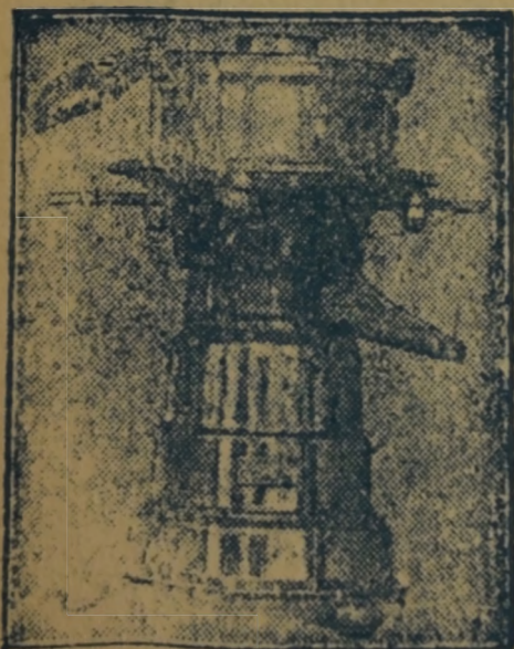
Model "X and A Special"

Prices F O B Factory; subject to change without notice.