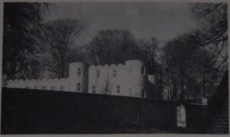
Glowing serenely in the sunlight, the splendid Saint Hill Castle is a symbol of the safe environment to be found at Saint Hill and in Scientology Organizations throughout the world