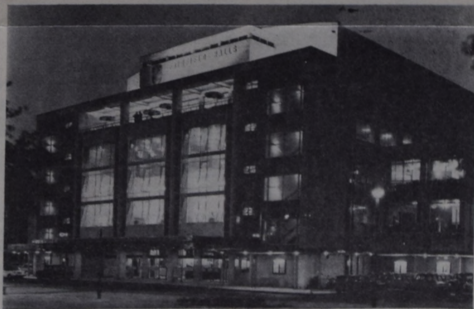
The magnificent Fairfield Halls, venue for the International "Unlimited Horizons" Congress on the 17th, 18th and 19th August, 1968