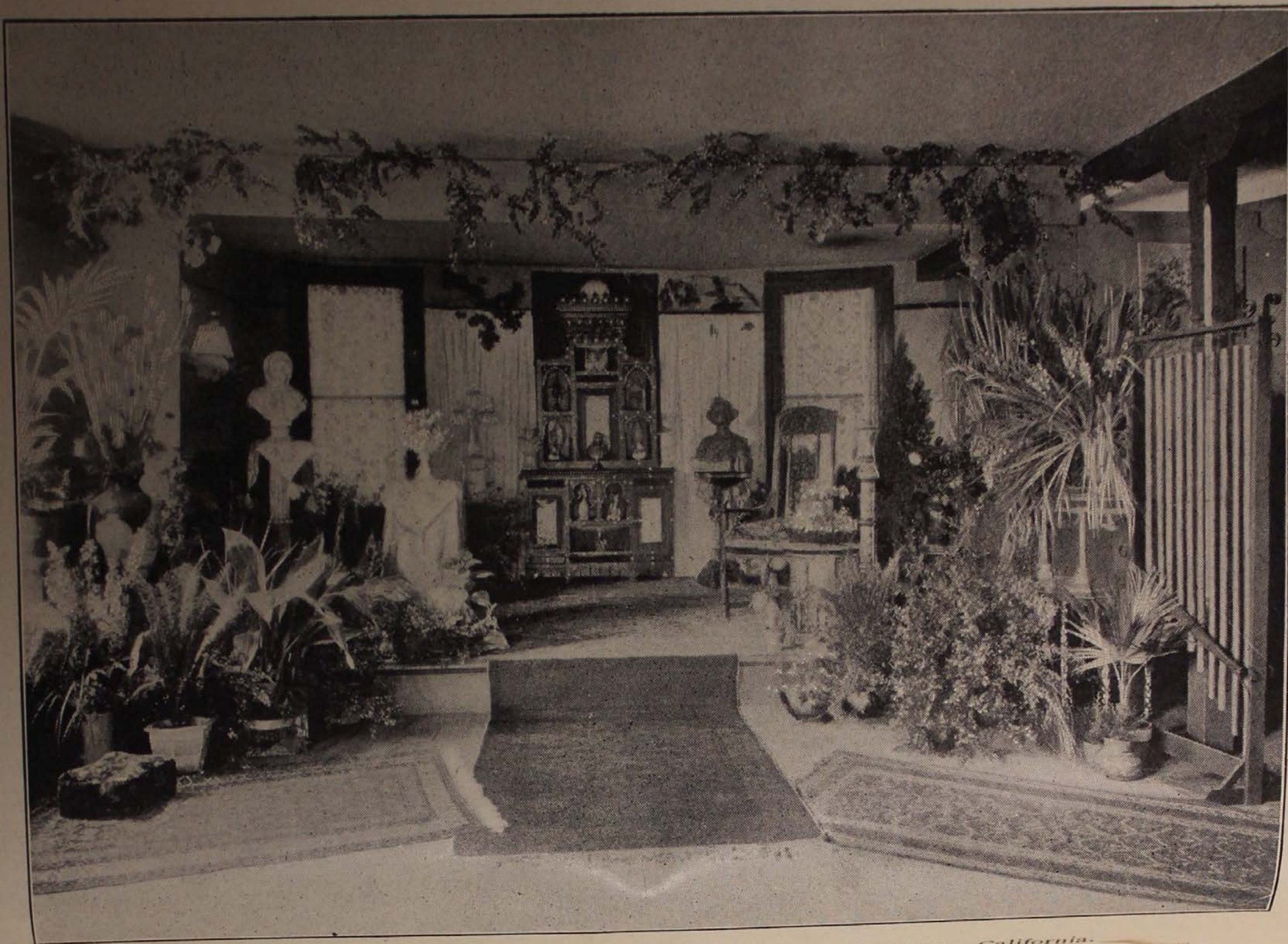
Oratory of the Oratory Institute, 410 Clay Street, San Francisco, California.